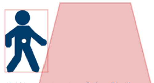
The field intersection trigger “edge of box” means the field alarms whenever any part of the object’s bounding box overlaps with the alarm field.