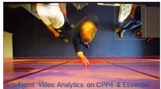
Intelligent Video Analytics on CPP4 & Essential Video Analytics museum mode: Ragged segmentation outlines but preservation of the hand. Alarming on edge of bounding box.

Calibration of the camera is not required for or used by the museum mode.