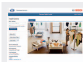
Plug & play camera commissioning by installer