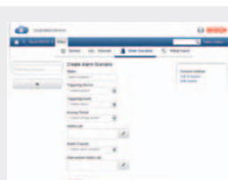
Remote service configuration at Central Station